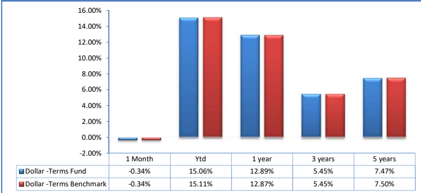
Performance is gross of fees and annualized over more than 1 year.

For more information on our range of offshore funds connect to our website: www.ginsglobal.com or call us on +27 11 883 9862.