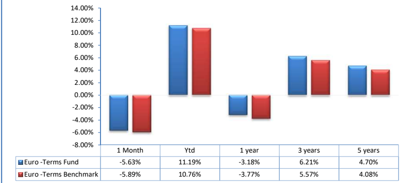
Performance is gross of fees and annualized over more than 1 year.