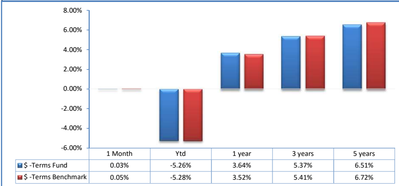
Performance is gross of fees and annualized over more than 1 year.

For more information on our range of offshore funds connect to our website: www.ginsglobal.com or call us on +27 11 883 9862.